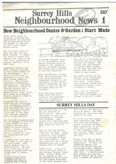
The first ever edition of the Neighbourhood News in 1982