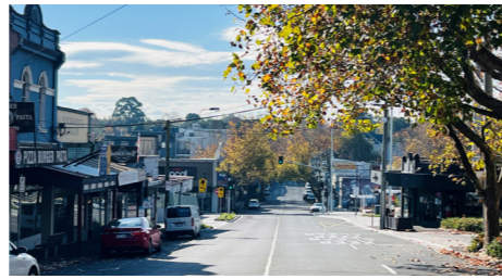
Union Road as is today

And now, we welcome you to Edition 250 . Quite a milestone!