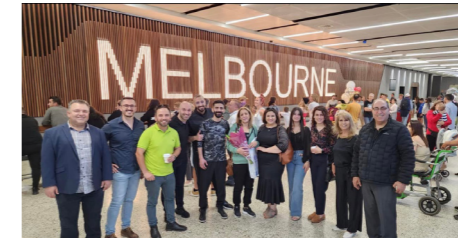
A refugee family being welcomed by their Sponsor Group at Melbourne Airport

Surrey Hills Neighbourhood Centre has, for the past eight years, been acting as a food drop-off point for the Asylum Seeker Resource Centre, enabling our community to provide vital support to some of those most in need. Your generous support has been much appreciated.