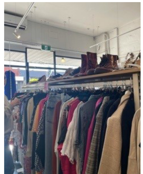
Inside the Malvern East Rack-it-Club store

This is held every Sunday morning, when the main car park is converted into a lively and energetic market. Each week there are around 370 stalls that sell clothes, shoes and accessories at a very respectable price. If you wanted to find some high-end, pre-loved bargains to upgrade your wardrobe, Rack It Club located in Hawthorn and Malvern East is the place to be. Rack it Club stocks clothing brands such as Bec and Bridge, Henne, Aje and so many more. It also gives you the chance to make your own money by renting a rack where you can sell your own pre-loved clothing!