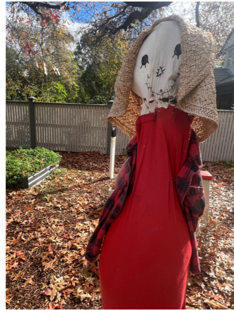
The Scarecrow at the Rose Avenue Herb Garden

So here's to our community herb garden – may it continue to grow and thrive, bringing us together and reminding us of the simple joys of nature. If you haven't already, why not take a stroll down and see what it's all about? Located on the corner