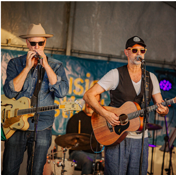
Performers at the Surrey Hills Music Festival