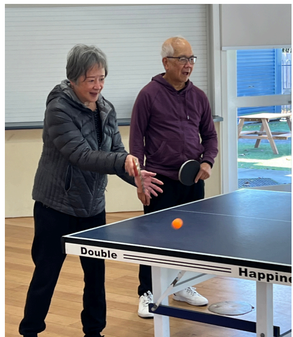
Fun at Table Tennis