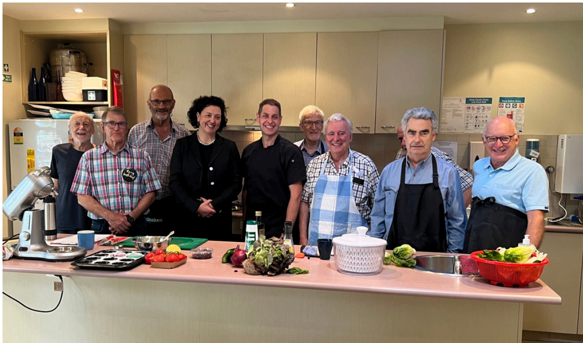
Dr Monique Ryan MP visiting our 'Blokes' Cooking Group