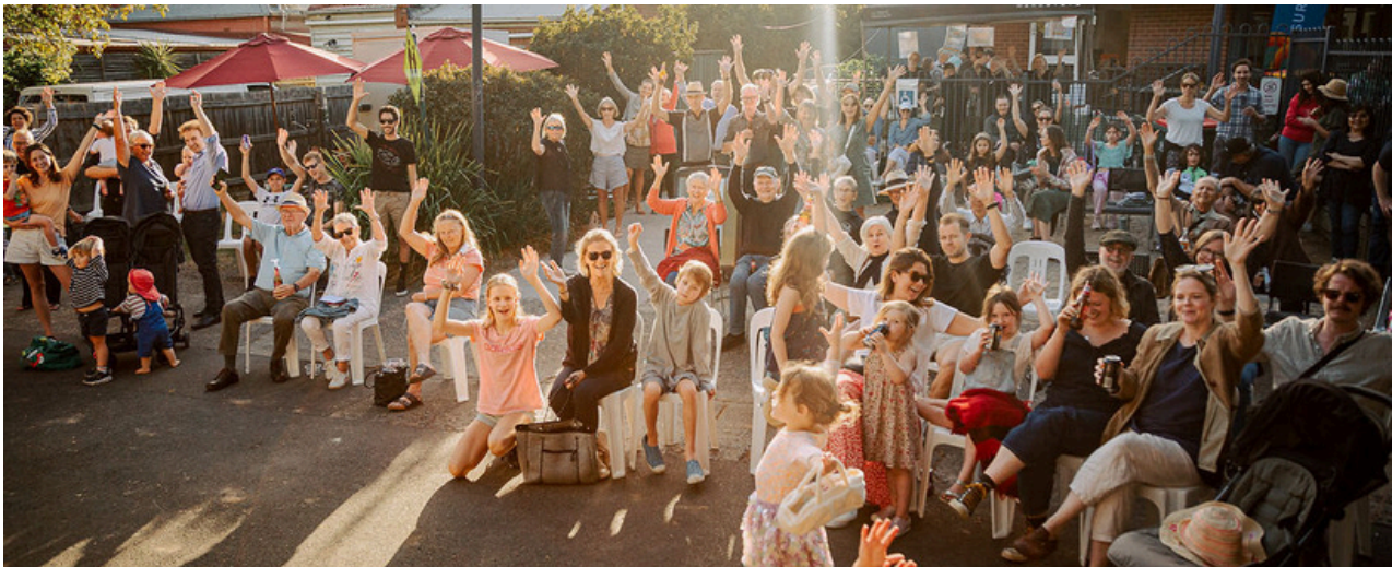
Community coming together to enjoy the Surrey Hills Music Festival

This year, 2024, is the 46th anniversary of the establishment of the Surrey Hills Neighbourhood Centre as a continuing focal point and resource for our community's social health and wellbeing. In recent years we have experienced the hardship of first the Covid epidemic and then the major disruptions caused by the Union Road rail crossing project. Thankfully things have improved a little since then. The Union Road precinct in which the Centre is located has been opened up with the removal of the rail crossing and a useful open area adjacent to the railway carpark created. The courtyard of the Neighbourhood Centre itself has been upgraded with more seating available for casual coffee catch-ups.