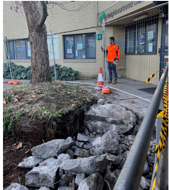
Construction of the new Centre courtyard

It's been a major hit with locals and it is an absolute delight to see both members and the wider public using the new space. People borrow books, enjoy a spot of sunshine or sit and chat to others while having coffee or lunch from nearby cafes.