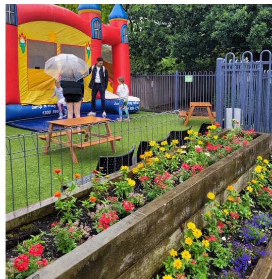
Dialing up the festive fun and colour at our Christmas Vibes event