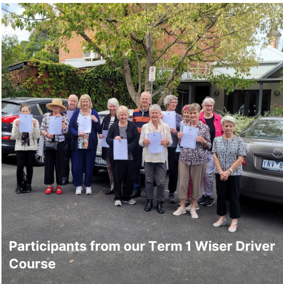
Participants from our Term 1 Wiser Driver Course

During this time, where cost of living pressures are high, low or no cost events have been very popular.