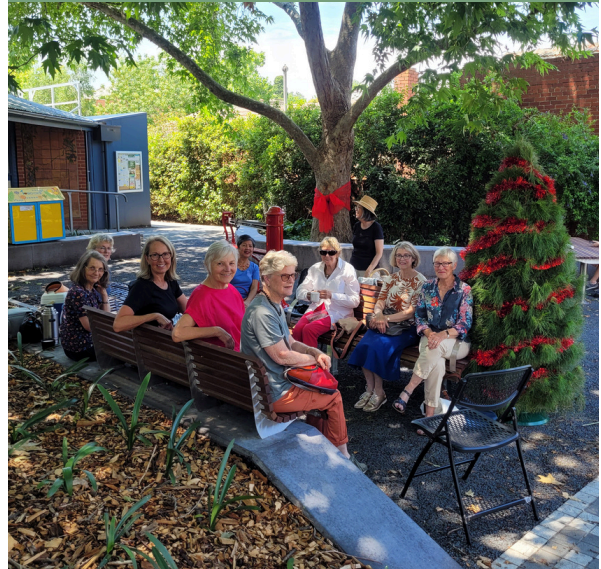
Class participants enjoying the new courtyard

“It’s a delight to observe the numerous coffee catch-ups that occur after classes and to see group leaders offering friendship and concern for members who’ve experienced challenges”.