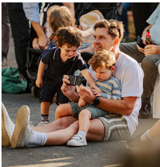
Crowds enjoying the music at the Surrey Hills Music Festival