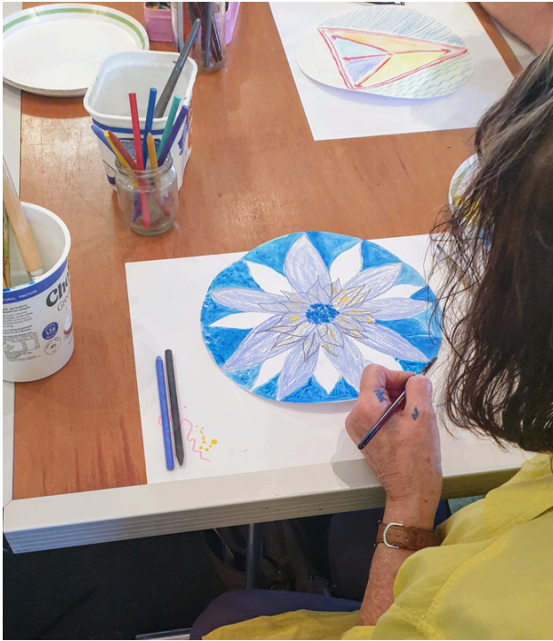
Medicinal art activity at our Women's Retreat