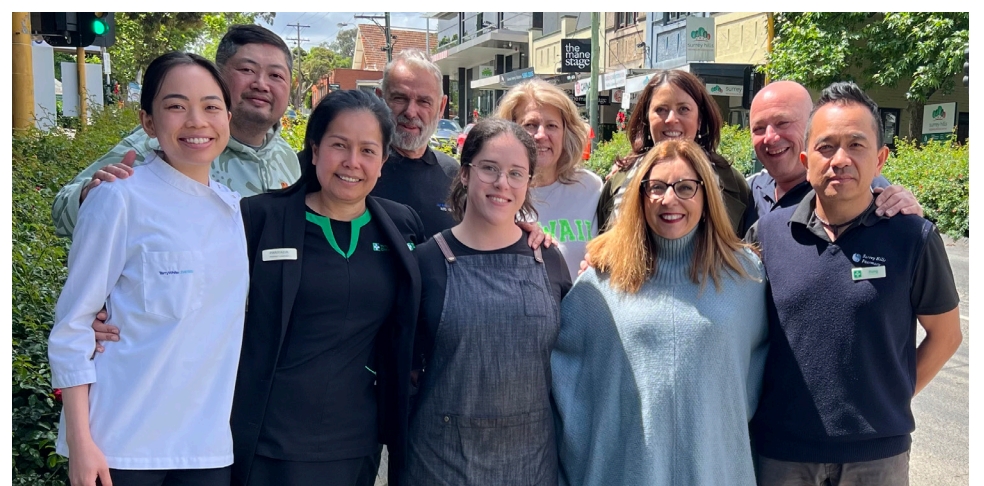
Union Road traders hoping to see you this Christmas