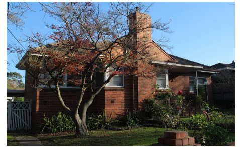
37 Pine Street was built in 1946 and is one of many homes that have been replaced by a larger home

A lot has changed since 2014 and people have moved, but we would like to bookend the project by inviting back those volunteers who participated to celebrate what has been accomplished. We will attempt to contact everyone personally, but if you are one of those volunteers and have changed your contact details, please contact Sue Barnett on 0417 368 990.