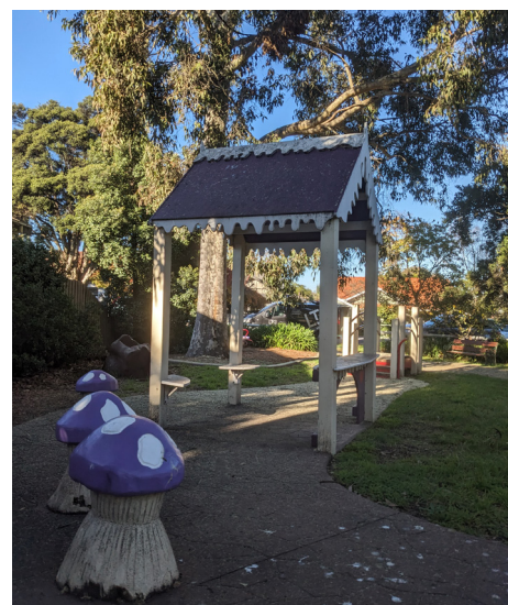
Empress Road Reserve

So I encourage you to get out your pram, dog lead or shopping bag and take yourself off your usual track to find some of these 'breathing' spaces that we are so lucky to have in our community.