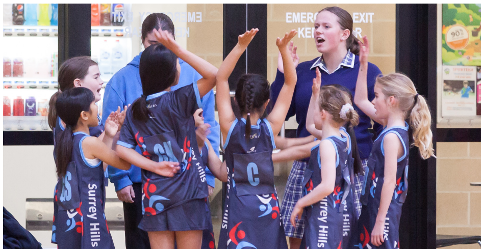
Team 'Hail', Surrey Hills Netball Club, Autumn 2024. Players from year 3-5 at school

SHNC is proud to have turned 10 last year. The club has grown from 8 teams during the pandemic to 14 this season (including two teams of boys and girls in their teens, and two beginner teams competing on Mondays). The club welcomes players from Grade 2 right through to Year 12 and beyond; with over 120 players and 40 volunteers it is a