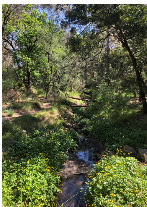
The tranquil open spaces at South Surrey Park (1)

In Surrey Hills we enjoy green places aplenty, with parks and sports grounds scattered liberally through our suburb. One of the most appealing parks - South Surrey Park – has a rich woodland replete with indigenous birdlife and plants. In Surrey Hills we also enjoy a strong volunteering culture. These characteristics come together in the Friends of South Surrey Park.