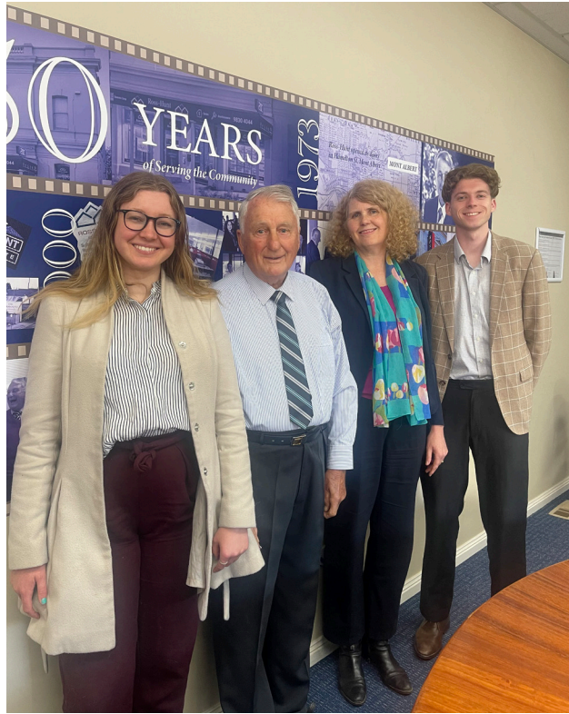
The Ross Hunt team as they usually appear!