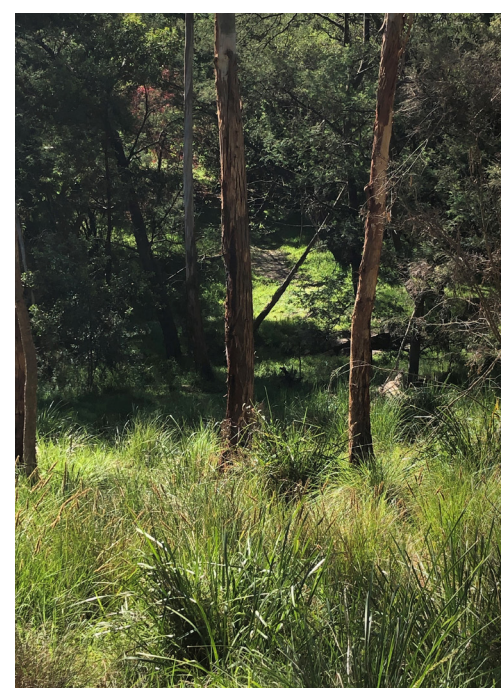
The tranquil open spaces at South Surrey Park (2)

https://www.southsurreypark.org/ southsurreypark@gmail.com https://www.facebook.com/southsurreypark