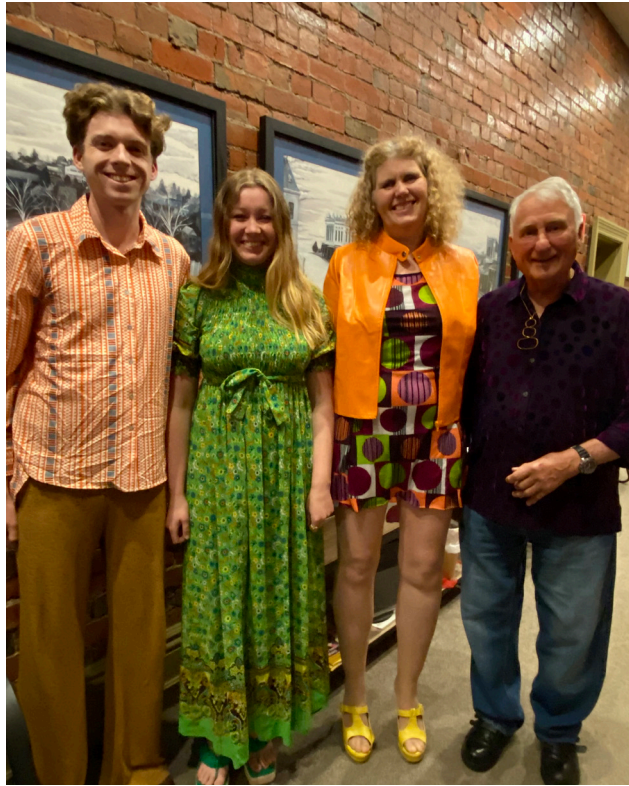
The Ross Hunt team dressed in the 70's gear.

Ross-Hunt are celebrating 50 years in business this year. They started in Hamilton St, moving to Norfolk Rd and finally to